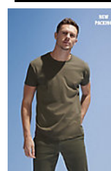
SOL'S REGENT 11380