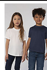
SOL'S REGENT KIDS 11970