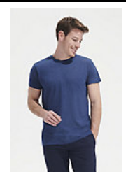
SOL'S REGENT FIT 00553